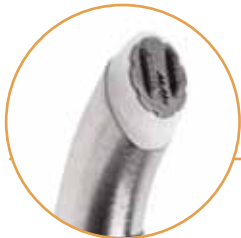
Ambient HipVac 50 Tip